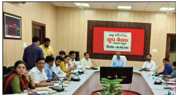
District Magistrate giving instructions after consulting subordinates

Development Officer. The District Magistrate reviewed various points related to the