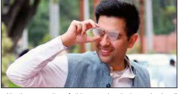
with the enormity of this tragedy, we stand in unwavering solidarity with the affected families," he said. The AAP parliamentarian further said, "Let me assure you that you are not alone in their grief. We are with you and we will support

condolences to the people of Wayanad. Your pain is immeasurable and your loss is shared by every citizen of this nation. As we grapple you through this darkest hour." "It is imperative that we respond to this disaster with the urgency and the com- passion it demands. I call the attention of the Minister (Home) to allocate an appropriate relief package to the state of Kerala," he added. Chadha said this package should not only provide immediate financial assis-