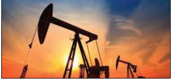
Lebanon's sovereignty and territorial integrity." The second strike, which has had a more profound impact on global oil markets, occurred hours later in Tehran. Ismail Haniyeh, who was in Iran for the swearing-in of President Masoud Pezeshkian, was killed in

rocket attack on the Golan Heights that resulted in the deaths of 12 civilians, mostly children, as reported by Reuters. Israeli Defense Minister Yoav Gallant described Hezbollah's actions as crossing a "red line," prompting retaliation with three rockets launched into the Haret Hreik neighborhood in Beirut. Lebanon's Prime Minister Najib Mikati condemned the attack as "blatant Israeli aggression," while Iran's Foreign Ministry criticized it as "a blatant violation of the attack. This event has dramatically heightened regional tensions and is expected to hinder ongoing Gaza ceasefire negotiations, with Iran, Qatar, Jordan, and Lebanon all condemning Israel's actions. Strikes On Hamas Impact Oil Price Surge - Here's Why The immediate aftermath of the strikes saw a notable increase in oil prices, reversing a month-long decline that had seen WTI and Brent crude hit seven-week lows despite previous regional conflicts. The dual strikes on Beirut and Tehran represent a significant escalation in the ongoing conflict, threatening to plunge the region into a more extensive war, as reported by a local media outlet.