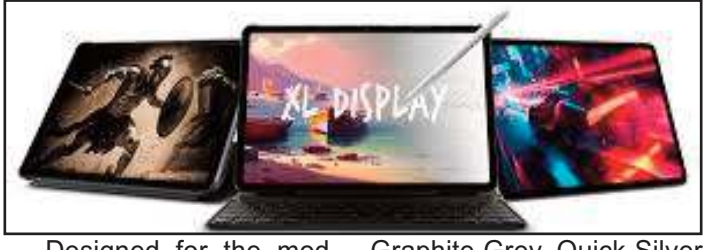
Designed for the modern user, the Redmi Pad Pro 5G combines advanced features with seamless 5G connectivity, pushing boundaries and empowering creativity and productivity. Tailored for creative professionals and entertainment enthusiasts, it features a 12.1-inch 2.5K XL display with a 120Hz refresh rate, quad speakers with Dolby Vision Atmos, and a 10000mAh battery for up to 16 hours of video playback. Xiaomi HyperOS Graphite Grey, Quick Silver, and Mist Blue, with optional accessories like the Redmi Smart Keyboard and Smart Pen to enhance productivity. The Redmi Pad Pro will be available starting at INR 19,999, with an INR 2000 discount for ICICI and HDFC Credit Cards and EMIs. The Redmi Pad Pro 5G is priced at INR 22,999 for the 8GB + 128GB variant and INR 24,999 for the 8GB + 256GB variant, inclusive of the same discount.

students at INR 9,999/- only ensures seamless integration with Xiaomi smartphones. It is available in Redmi Pad Pro 5G Accessories include the Redmi Smart Pen and Redmi Keyboard, each priced at INR 3,999, and the Redmi Pad Pro Cover at INR 1,499. Redmi Pad SE 4G: The Redmi Pad SE 4G provides immersive viewing and efficient multitasking, delivering exceptional value and performance with practicality. It features a compact 8.7-inch 90Hz display and dual speakers with Dolby Atmos, complemented by a 6650mAh battery, MediaTek Helio G85 processor, and 4GB RAM for efficient performance. With TÜV Rheinland Low Blue Light and Flicker-Free certifications for eye comfort, it is available in Forest Green, Urban Grey, and Ocean Blue. The Redmi Pad SE Cover adds protection and improves viewing