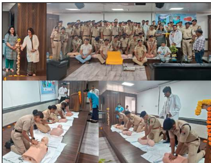
Glimpses of the Cardio Pulmonary Resuscitation (CPR) workshop for RPF personnel organized by WR's Jagjivan Ram Hospital.