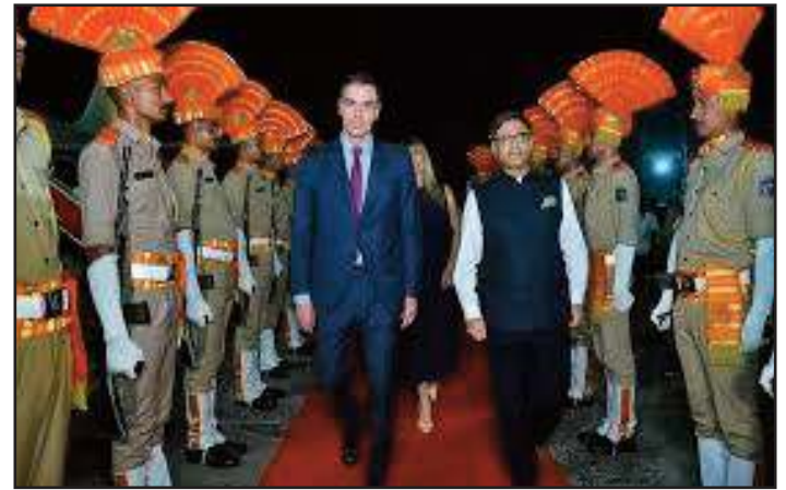
Milestone in Vadodara

This facility aims to develop a comprehensive