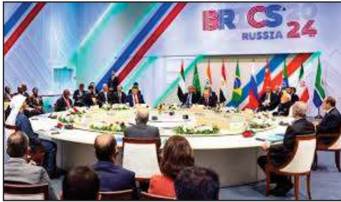
Mediator: India's Evolving Role In Balancing BRICS And G7 Interests

is hard since BRICS lacks "a unified economic policy of the bloc and its political cohesion in the process." The Rise Of A Global