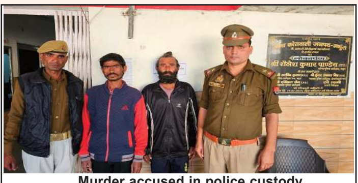
Murder accused in police custody