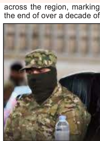
authoritarian rule. Al-Jolani, who is now

(Gns). Syria's long-running civil war reached a historic milestone on Sunday when Abu Mohammed al-Jolani, the leader of the Islamist rebel group Hayat Tahrir al-Sham (HTS), declared victory following the swift takeover of Damascus. The rebel forces, in a lightning offensive, captured the Syrian capital in under two weeks, leading to the collapse of President Bashar al-Assad's regime. The fall of Assad's government has led to widespread celebrations within Syria and