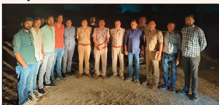
Jamunapar Police and SOG team at encounter site