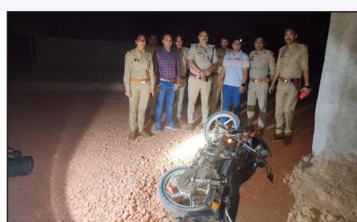
Mahavan police station at the encounter site