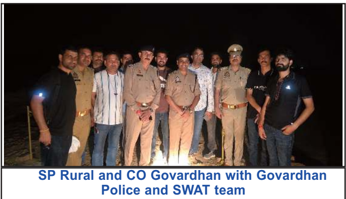
SP Rural and CO Govardhan with Govardhan Police and SWAT team

Two other miscreants were arrested. Pulsar motorcycles, mobiles, 1400 rupees, 2 pistols, 2 khok cartridges,